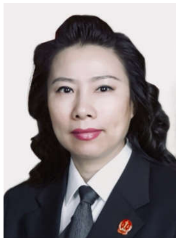
Zhang Xiaoqi PPSA Top 10 Excellent- Chinese Photographer